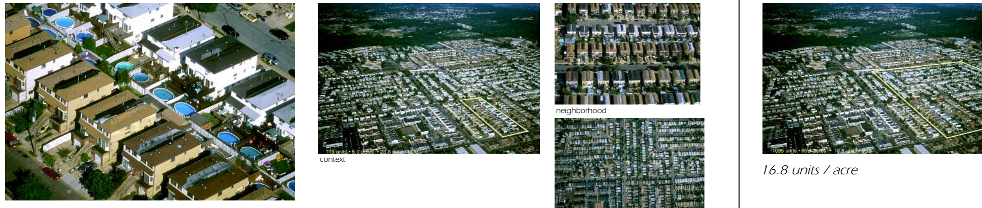
Staten Island, NY 23.7 units / acre