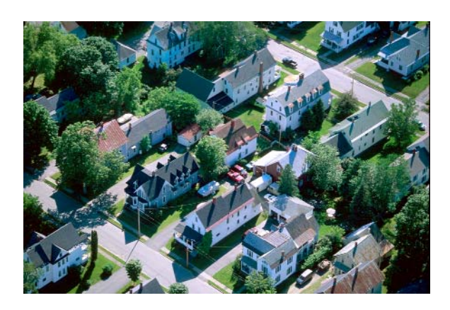
Kansas City, KS 11.1 units / acre