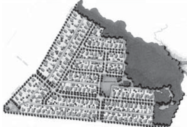
Figure 12-2 Plan view of 'green infrastructure' development pattern for Cumbria Woods.

The parks and open space are designed as an integrated network. Public sidewalks, pedestrian paths, and park trails provide residents from within Cumbria Woods, as well as the rest of the Village of Cumberland, with pedestrian access to the lagoon trail and other greenway systems beyond the site. They also provide an important detention and infiltration function for the naturalized stormwater system – and in so doing, help to protect streams and ground water quality and quantity both on and off the site. Alongside 'pedestrian friendly' green streets, the parks and open space systems are key social and green infrastructure elements of this alternative development pattern.