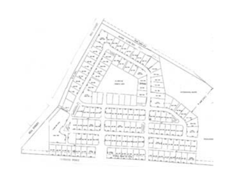
Figure 12-1 Plan view of conventional, status quo development pattern for . Cumbria Woods.

The required 7.35 acre environmental buffer on the northeast side of the site is retained. Public access onto this site is available through two 3-metre wide pedestrian private, fenced backyards line the edge of this open space zone. In addition to the private backyards, exists along the eastern edge of the site. A total of 2.60-acres has