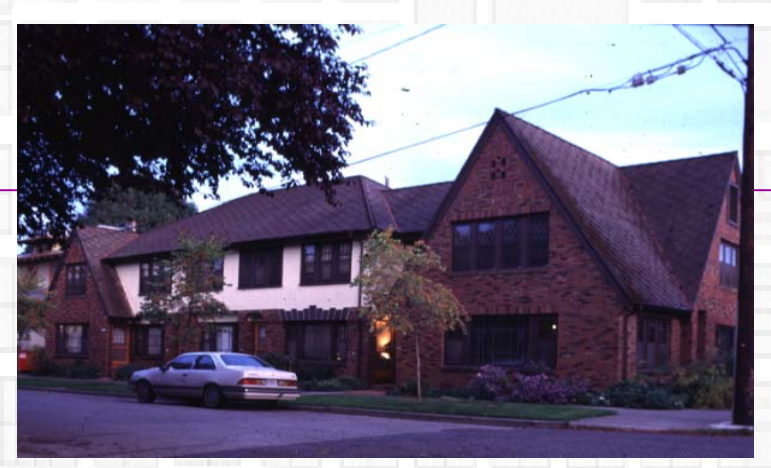
Rowhouses, Southeast Portland