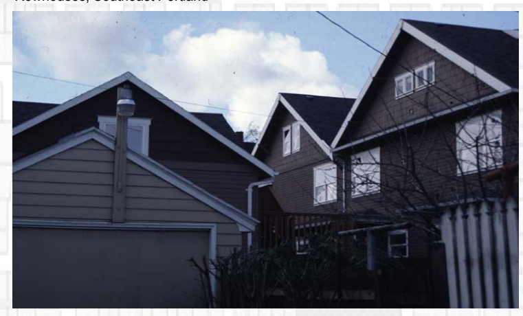
Accessory dwelling unit on a bungarow, Southeast Portland