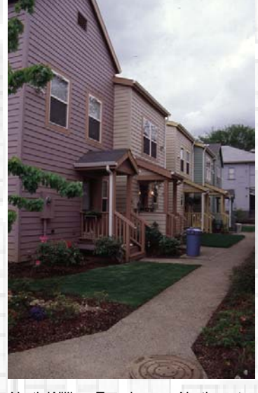
Duplex, Southeast Portland