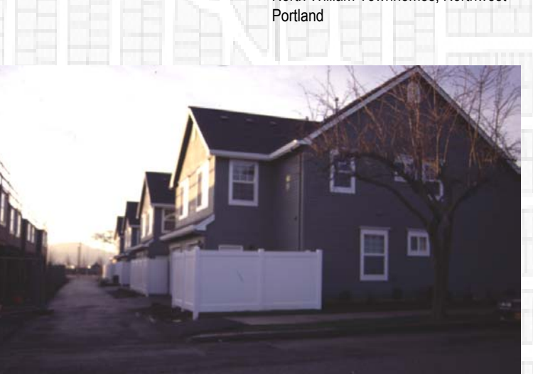
Buckman Heights Townhomes, Northeast Portland