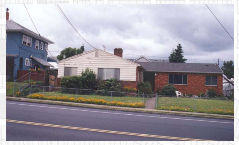
Tri-plex, North Portland