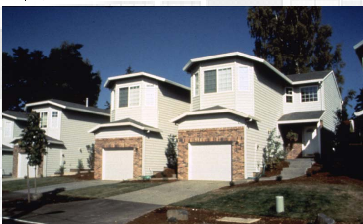
Single family homes, Portland Metro region