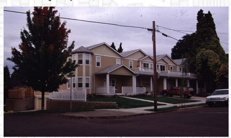
Infill rowhomes Southeast Portland