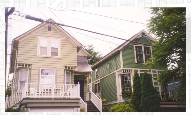
Two small lot single family homes, Southeast Portland

Any neighborhood may have housing in the range of 17-20 dwellings per acre.* These homes range from small-lot single family dwellings to townhomes, rowhouses and multiplexes. They are usually found as infill in older neighborhoods. Depending on the design, they blend into their surroundings so well, you can't tell that they are higher density housing!