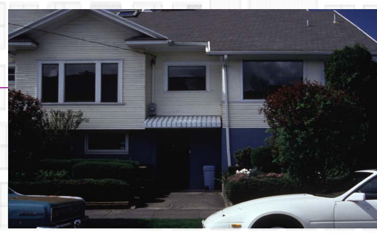
Single family house with basement accessory dwelling unit, Southeast Portland